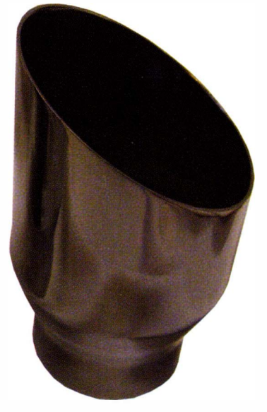
Tin-cobalt alloy topcoats eliminate chrome and can be formulated to provide appearances from bright to dark, as these muffler components illustrate.

acid solutions are electrolyzed. The amount of chromic acid mist generated depends on several variables such as part loading, time, current density and concentration. Potential adverse health effects associated with Cr<sup>+6</sup> exposures include lung cancer, asthma, and damage to the nasal epithelia and skin. On February 28, 2006, the Occupational Safety and Health Administration (OSHA) published the final Hexavalent Chrome Standard. The three separate standards covering occupational exposures to Cr<sup>+6</sup> included general industry (1910.1026), shipyards (1915.1026), and construction (1926.1126). The Permissible Exposure Limit (PEL) of 5µg/m<sup>3</sup> was established in all three versions. OSHA requires employers to use monitoring and analytical methods to measure airborne levels of Cr<sup>+6</sup>.