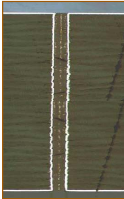
Figure 2. DC Plating 6mil in 93 mil thick board; 10 ASF for 120 minutes, 80% throw.

Pulse Plating. For the last few years the copper plating industry was focused on pulse plating and, in particular, periodic pulse reverse as the solution for all. As time progressed and the level of difficulty continued to climb, the plating current density for pulse began to drop and the primary advantage of plating at