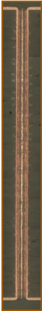
Figure 1. DC Plating at 8 ASF for 220 minutes; 6 mil hole in 240 mil thick board, 51% throw.

higher current density began to disappear. Add to that the complexity of operating a pulse rectifier with added definition of ASF, forward to reverse ratio, duty cycle and waveform. In many instances, pulse also required an elaborate and frequent scheme of organic regeneration to maintain the copper thickness distribution benefits.